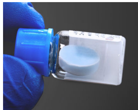
LyoPrime Luna™ Probe One-Step RT-qPCR Mix with UDG (NEB #L4001)

As noted previously, the amount of material that can be dried in a single freeze dryer is dependent upon the specifications of the dryer, but also by the primary packaging footprint. Product height plays a lesser role, provided it does not impact the