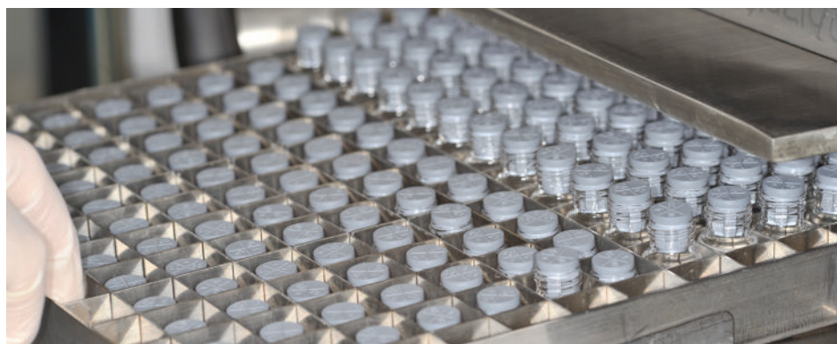
Glass vials are ideal for reagent manufacture: glass is impervious to both oxygen and moisture