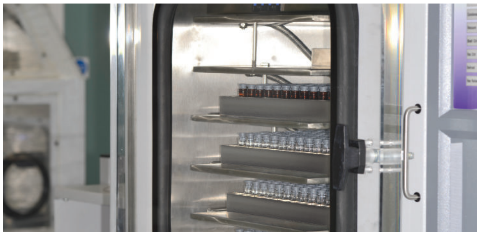
A typical freeze dryer

Depending upon your product needs, NEB Lyo Sciences can carry out functional and materials testing. Functional testing of custom products verifies post-drying performance. NEB Lyo Sciences has thermocyclers and lab automation tools to qualify your products as soon as drying is completed. Materials testing may include residual moisture determination using Karl Fischer analysis. This provides important infor-