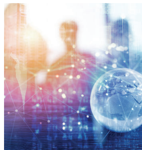
Environmentally Friendly Global Distribution: Lyophilized products are not constrained by supply logistics.

Our team can provide a variety of materials and biologics to meet functional and cost requirements for each custom project. We can manage the supply chain for your enzymes and other components as needed. Custom products may draw on the NEB portfolio of enzymes and biologics and the combined expertise across our organizations to provide your specification lyophilized from a single provider.