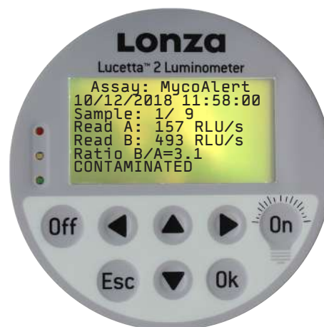
Figure 8: Example of a logged measurement

Use arrow button down ▼ to view all measurements.