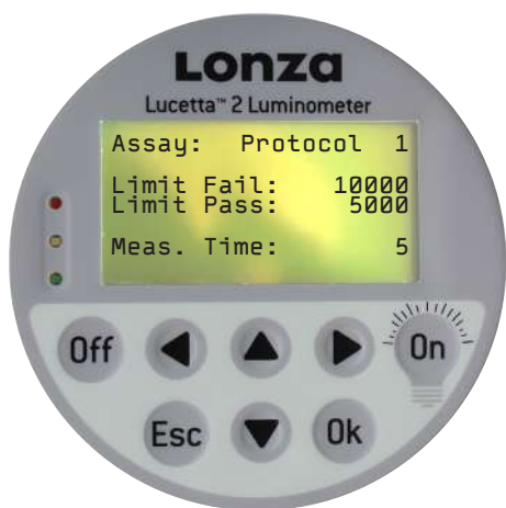
Figure 12: Display for setting Single Read parameters