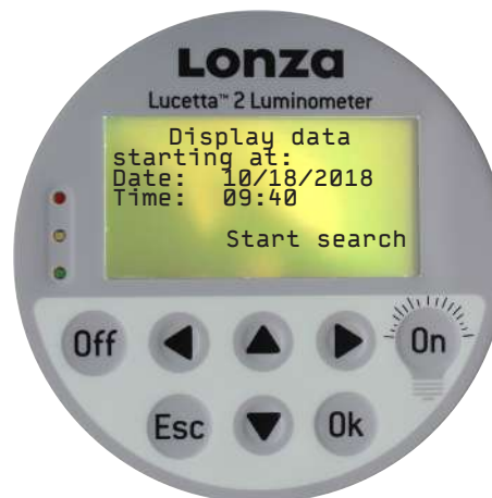
Figure 7: Example of time and date selection to view measurements

To change the date displayed, use arrow button ▲ to select DATE and press OK. Use arrow buttons ►◀ to select day, month or year. Depending on the selected country for the date format (for more details see section 6.0), the format is MM/DD/YYYY (USA) or DD.MM.YYYY (Europe). The flashing cursor indicates the number to be adjusted (Figure 7). To change the time displayed, select TIME to change hours and minutes as described for changing the date.