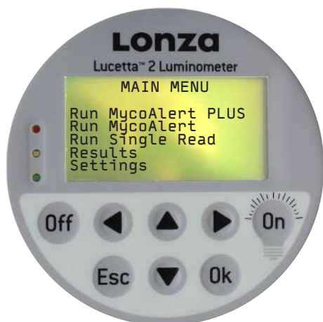
Figure 4. Main menu of the Lucetta™ 2 Luminometer.

On the front face of the Lucetta™ 2 Luminometer is an LCD display showing the menus, the measurement parameters, and the measurement results. To open a submenu from the main menu (Figure 4) move the gray select bar up and down by using the two arrow buttons ▲▼. Once at the desired position, press OK to activate that choice.