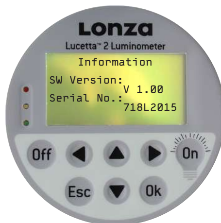
Figure 15: Display for software version and serial number information