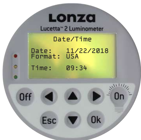
Figure 13: Display for setting date and time