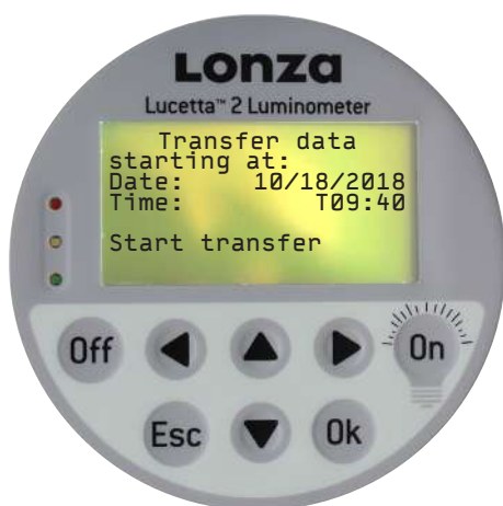
Figure 9: Example of transfer result screen