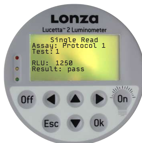
Figure 6. Example of a Single Read measurement screen. The result of the measurement is 1250 RLU.