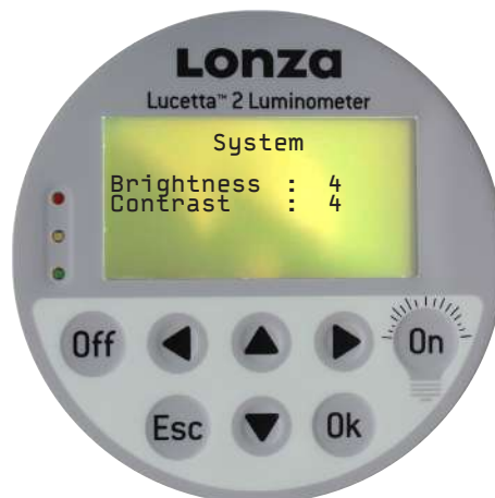
Figure 14: Display for adjusting display brightness and contrast