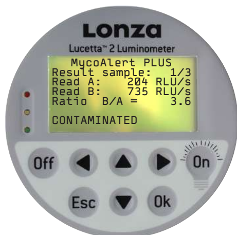
Figure 5. Example of a MycoAlert™ PLUS Measurement screen. In this case, CONTAMINATED is displayed as the B/A ratio is 3.6.