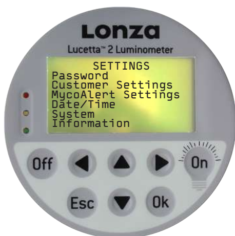
Figure 10: Submenu SETTINGS

Via the submenu SETTINGS (Figure 10) the Lucetta™ 2 Luminometer allows the setting of a user password, creation of customized protocols in Single Read mode and date and time setting options. Display settings such as brightness and contrast can also be optimized here. Instrument settings for MycoAlert measurements are password-protected and can only be accessed by Lonza service personnel. Software version and serial number of the luminometer can also be reviewed in the submenu.