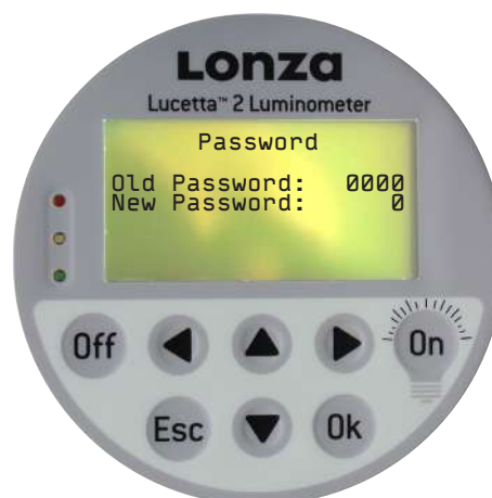
Figure 11: Display for setting a password